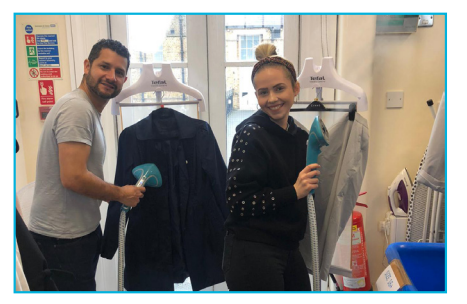
Book a Wardrobe Day

Check out our Fundraising Pack for other ways to support Smart Works.